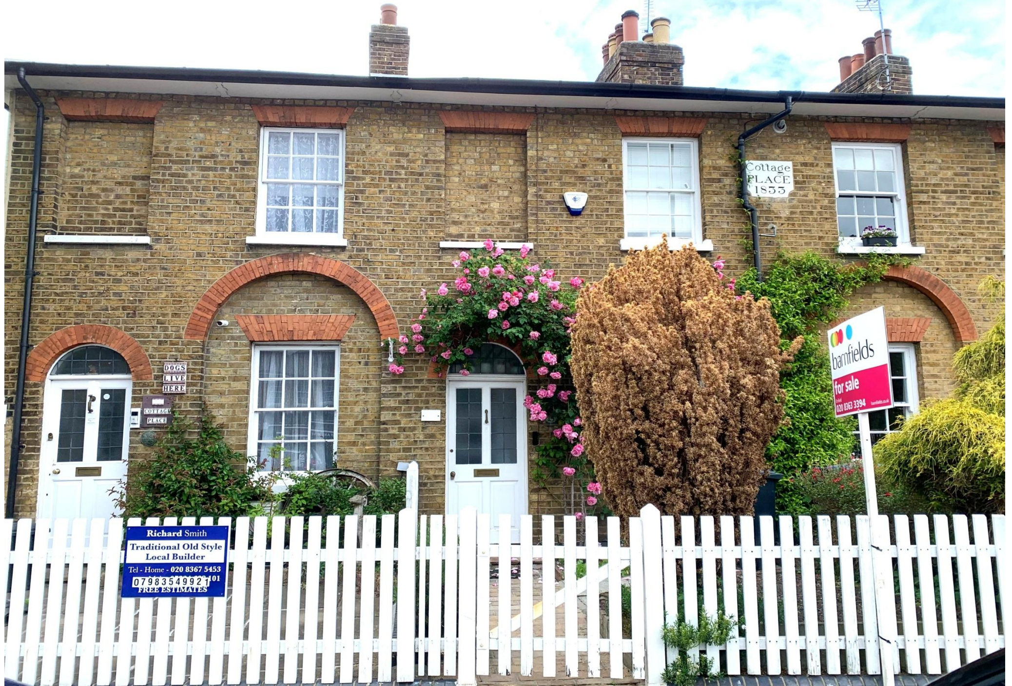
Forty Hill, Enfield, EN2 9EG