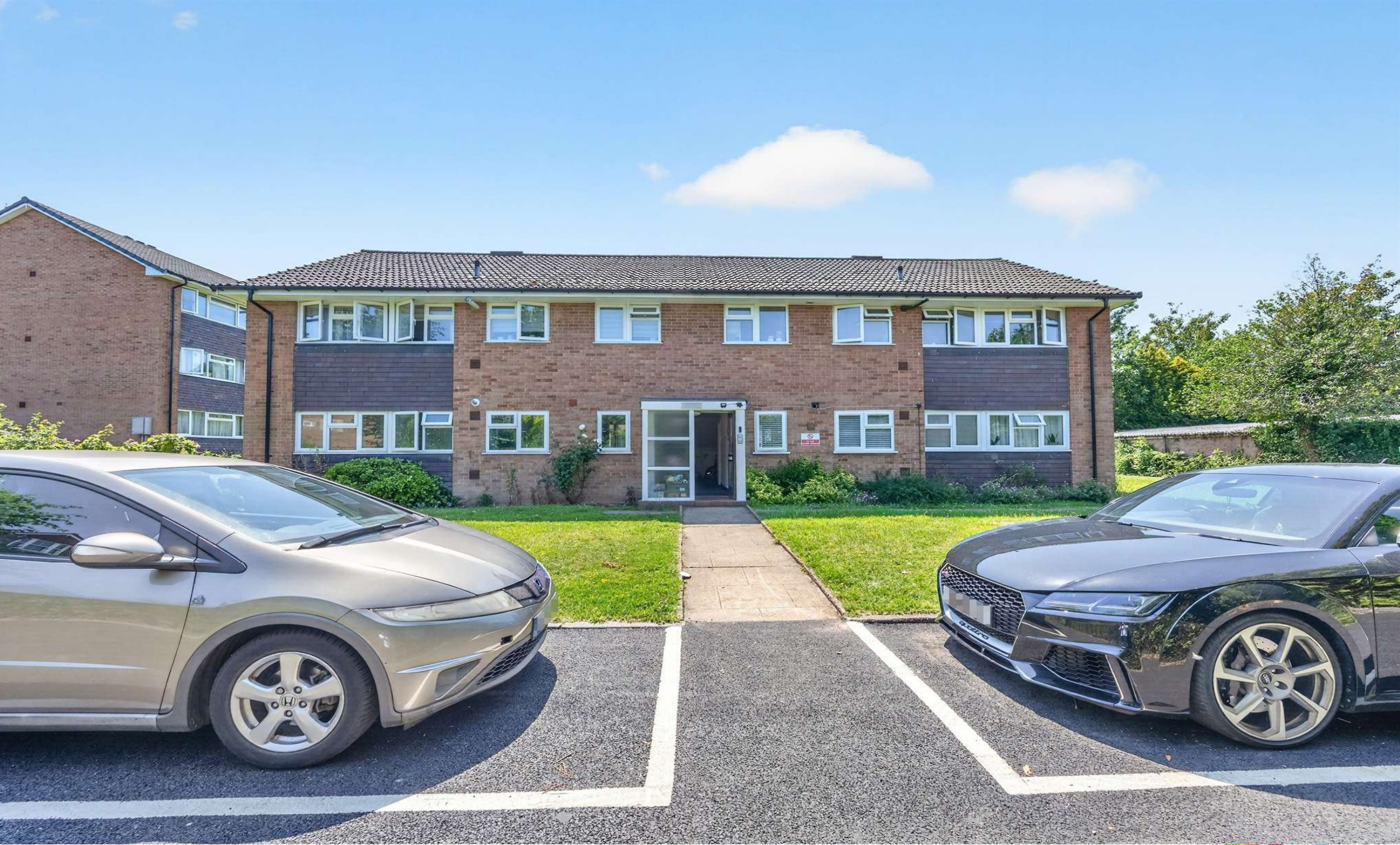
Hurst View Grange Pampisford Road, South Croydon CR2 6DL