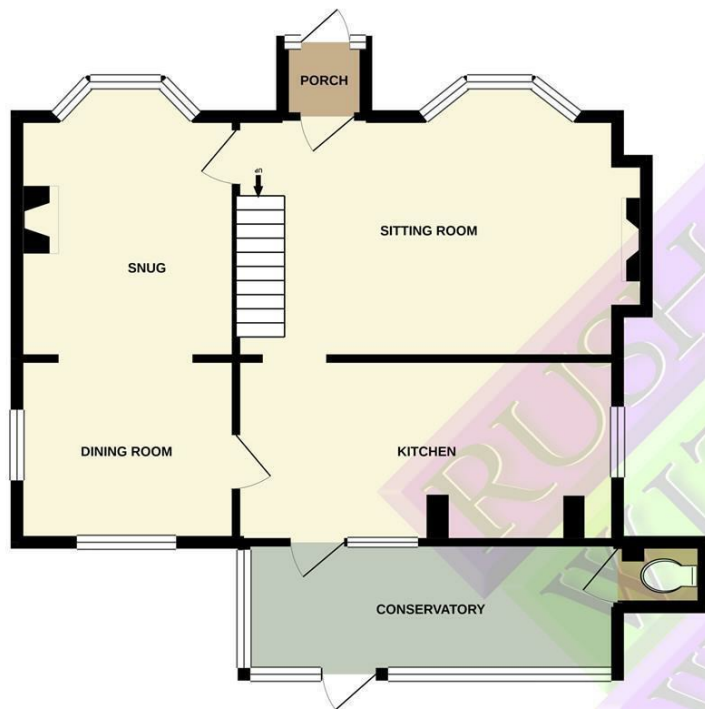
GROUND FLOOR 711 sq. ft. (66.0 sq. m.) approx.