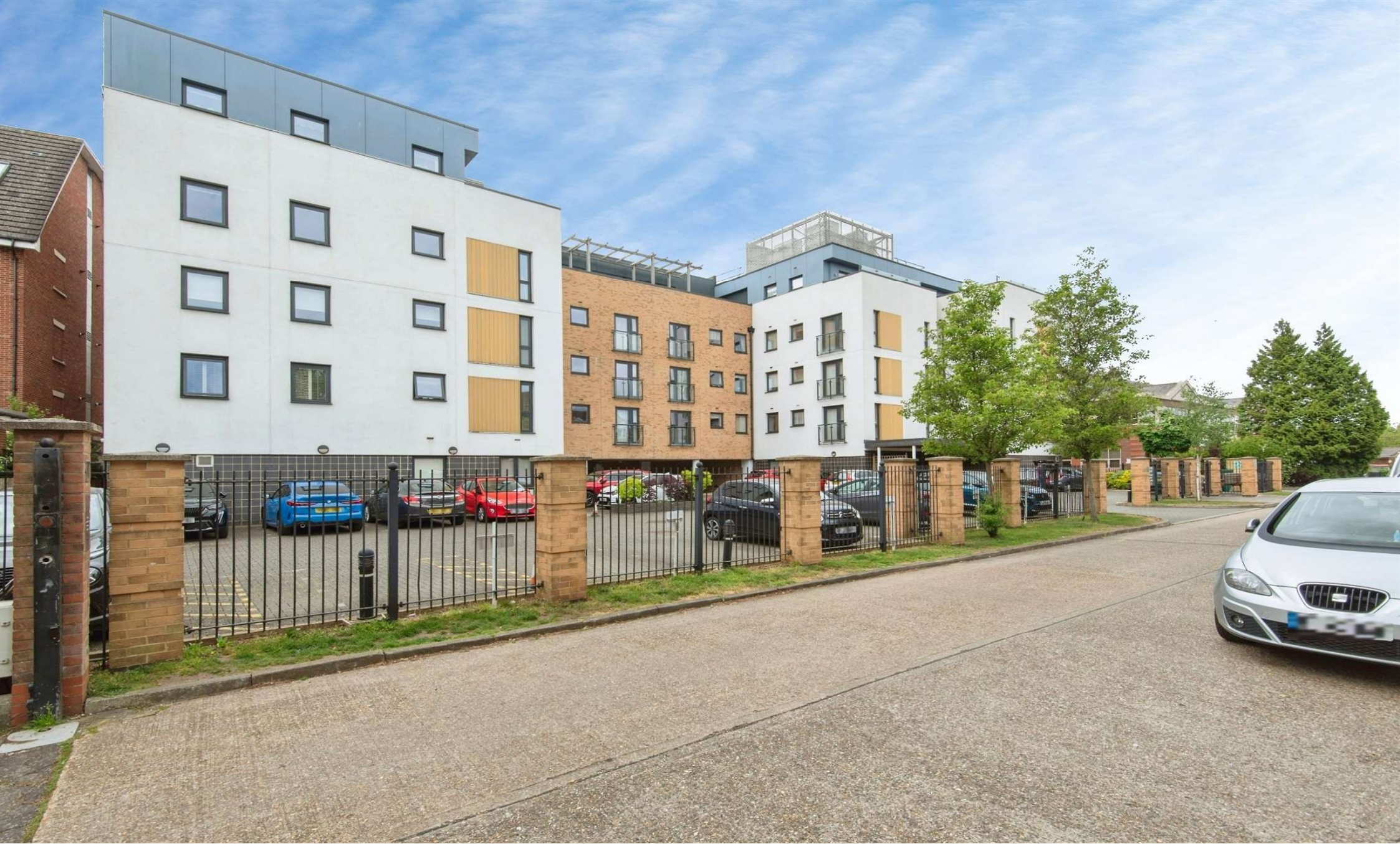
George House Primett Road, Stevenage SG1 3EE