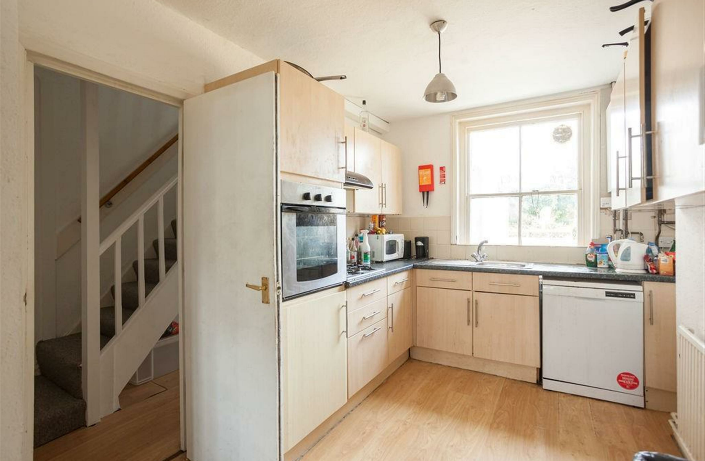
106 Islingword Road, Brighton, East Sussex, BN2 9SG