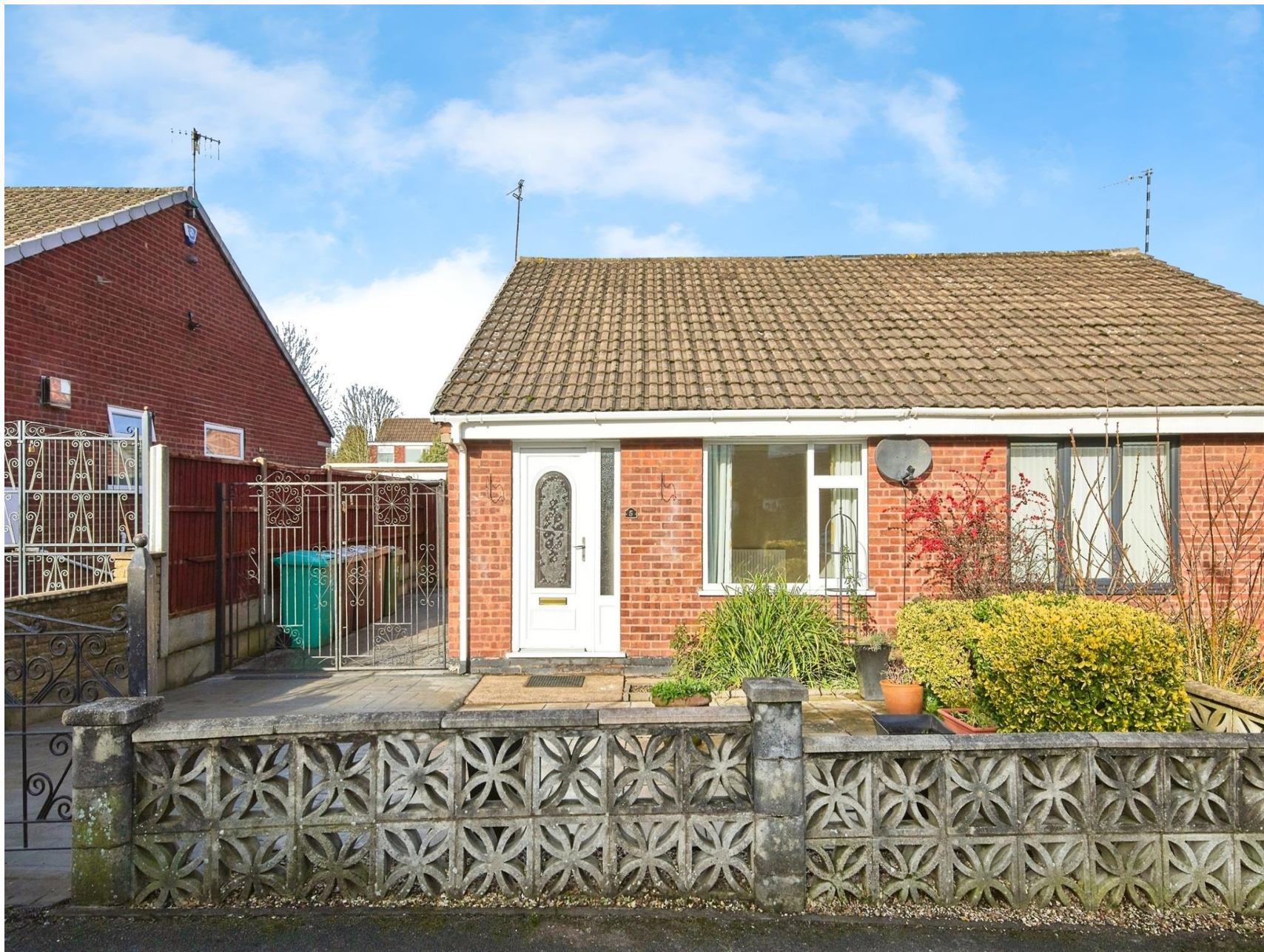
Lion Close, Nottingham NG8 5ED