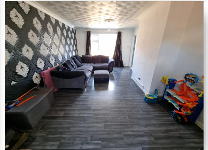
Fundrey Road, Wisbech PE13 3TP