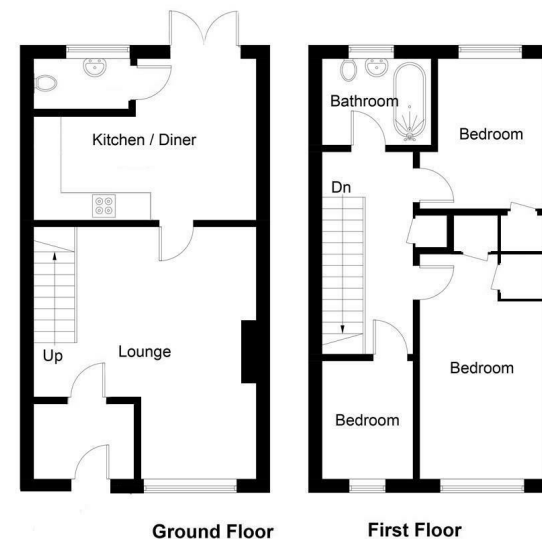
Approximate Gross Internal Area = 92.8 sq m / 999 sq ft

The property is ideally positioned approx 1.5 miles from Hatfield Peverel train station with direct links to London Liverpool Street and within short walking distance of open countryside, offering an array of amazing walks and also the nearby Recreational Park.