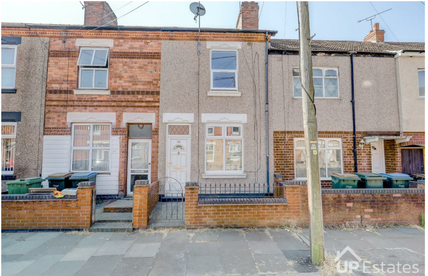
Caludon Road, Coventry