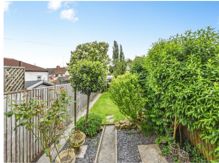
The Butts, Frome, BA11 4AE