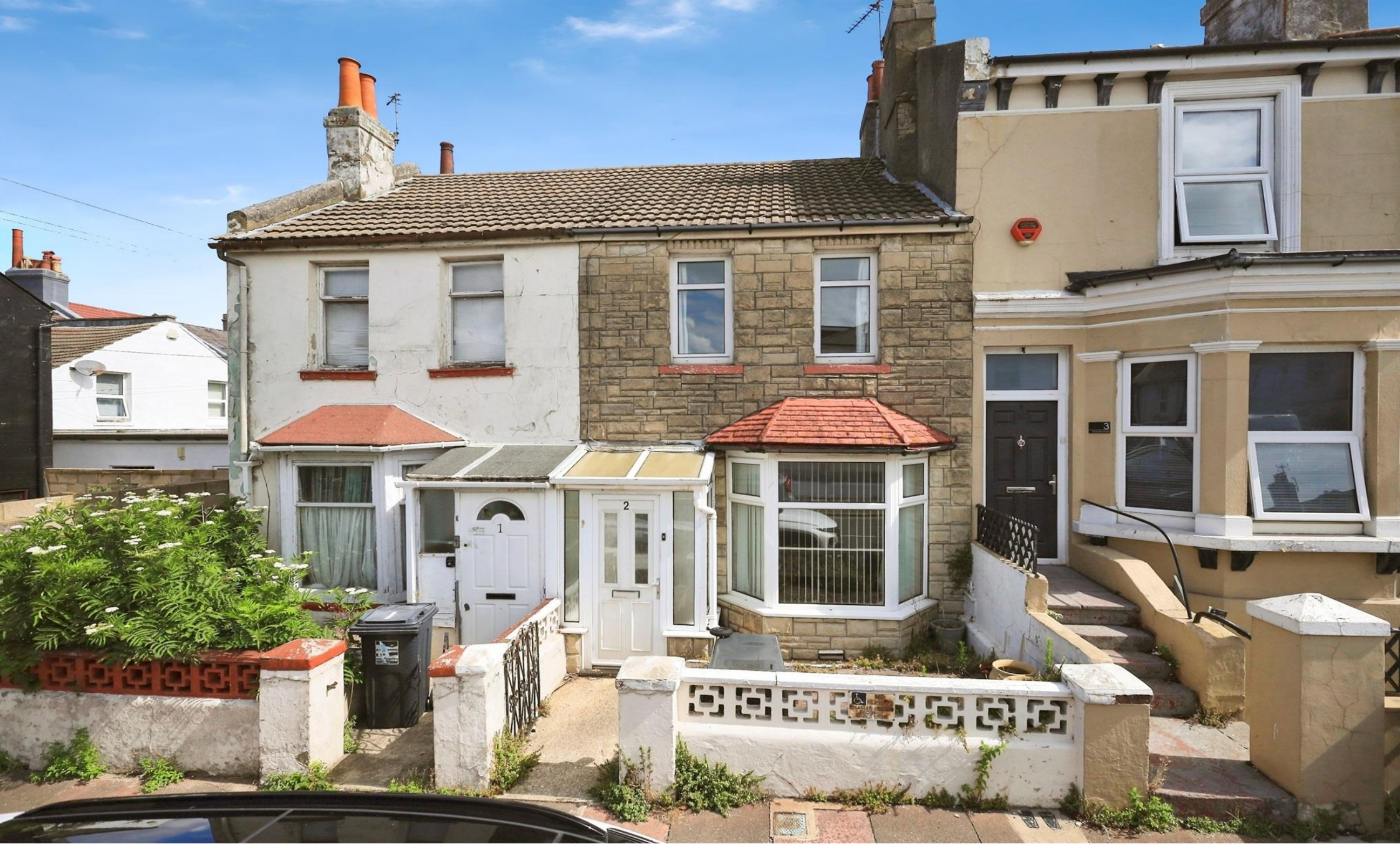
Beamsley Road, Eastbourne BN22 7EH