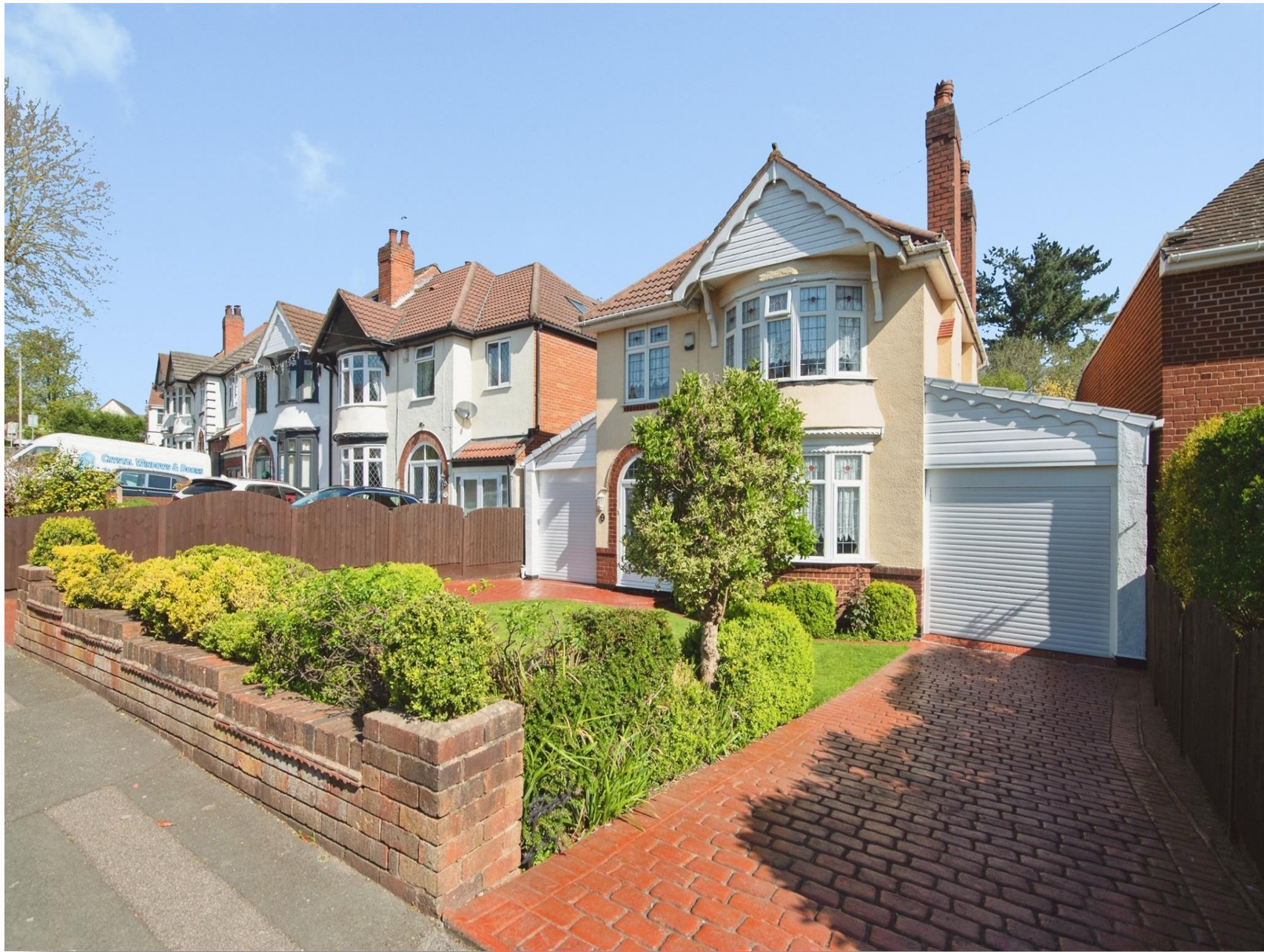
St. James's Road, Dudley DY1 3JB