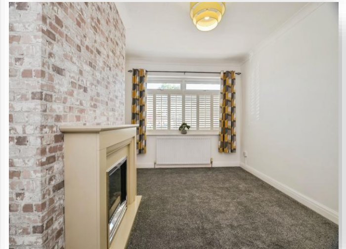
Rimdale Drive, Stockton-On-Tees TS19 7LD