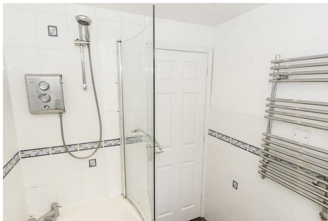
Bathroom (Photo Two)

Panelled bath with electric shower fitment over. Pedestal wash hand basin. Low level WC. Complementary tiled walls and floor. Heated towel rail. Extractor fan. Opaque double glazed window.