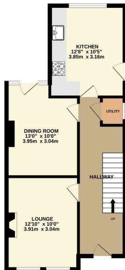
GROUND FLOOR 525 sq.ft. (48.8 sq.m.) approx.