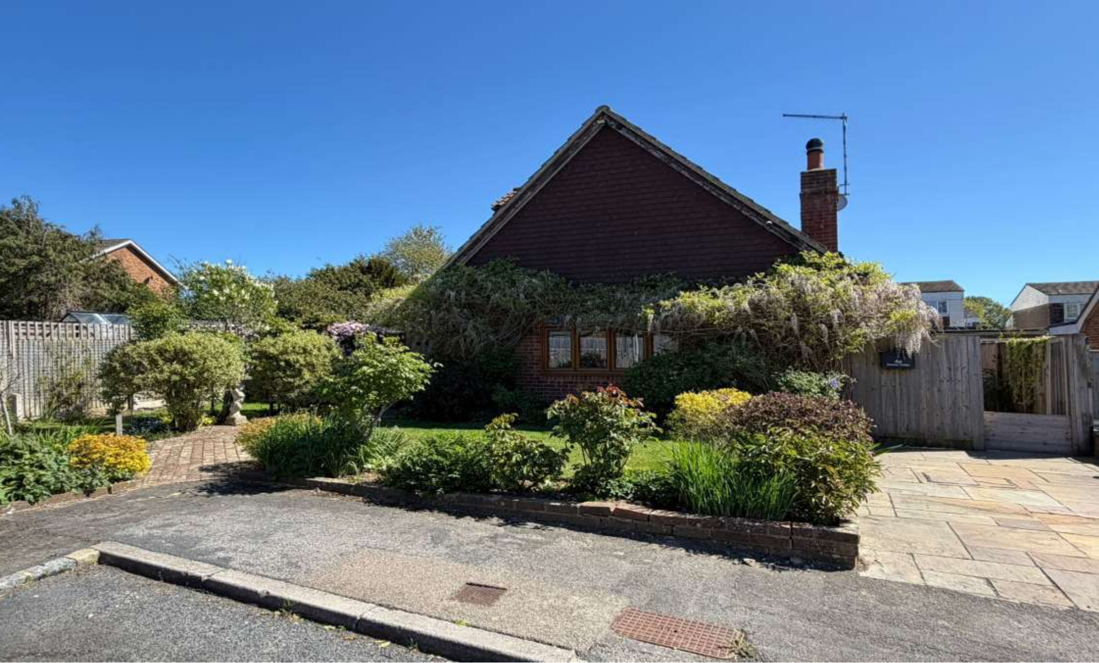
Hamelsham Court, Hailsham BN27 3EL