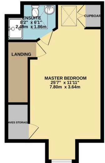
2ND FLOOR 358 sq.ft. (33.3 sq.m.) approx.