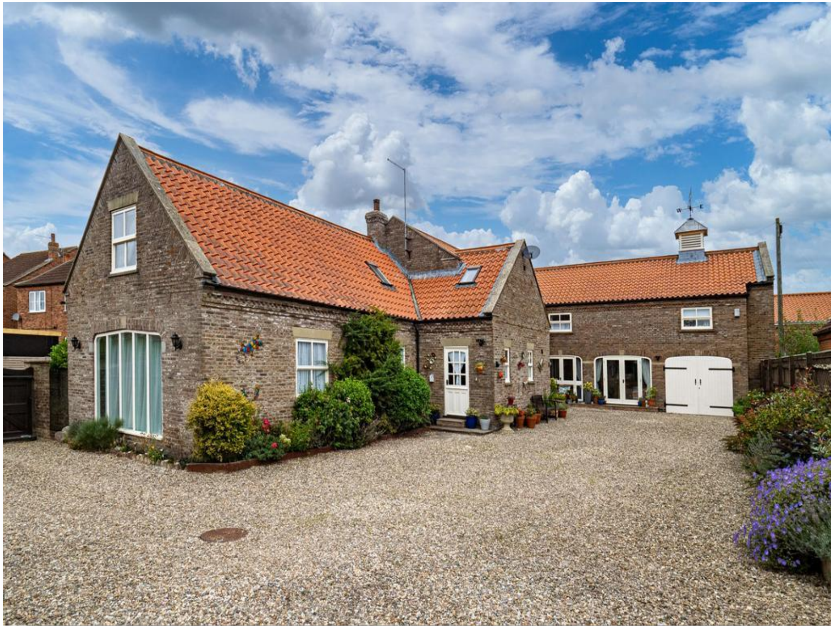
The Shires Main Street, Beeford, Driffield, YO25 8AY