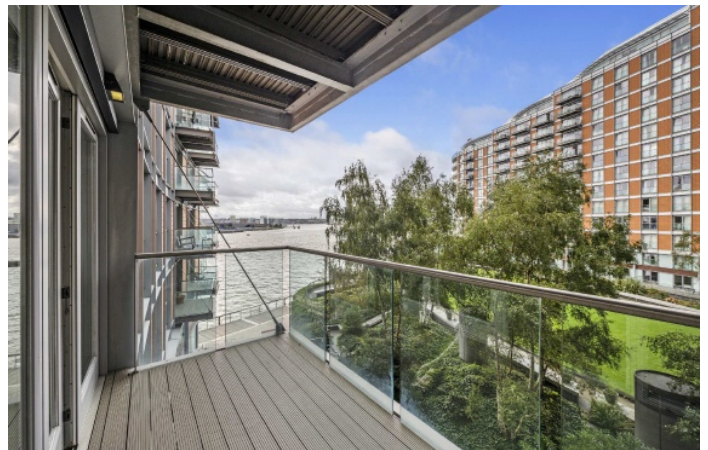
Fairmont Avenue, E14