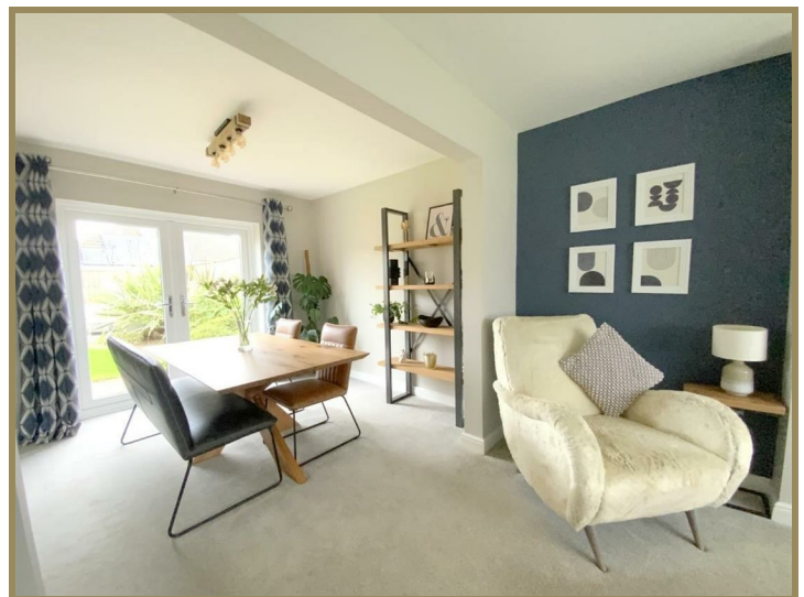
4 Pagehall Close, Scartho, North East Lincolnshire, DN33 2HF £265,000