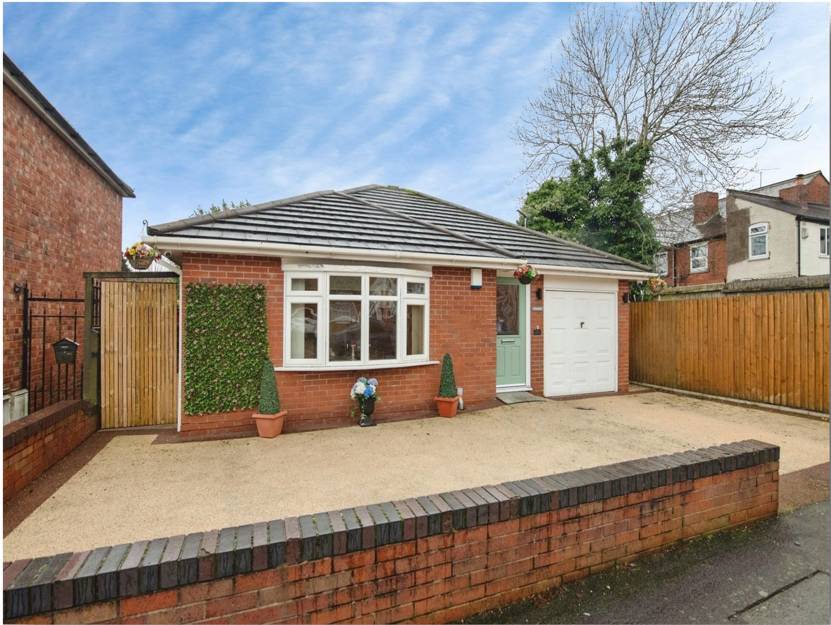
Mackmillan Road, ROWLEY REGIS B65 8AS