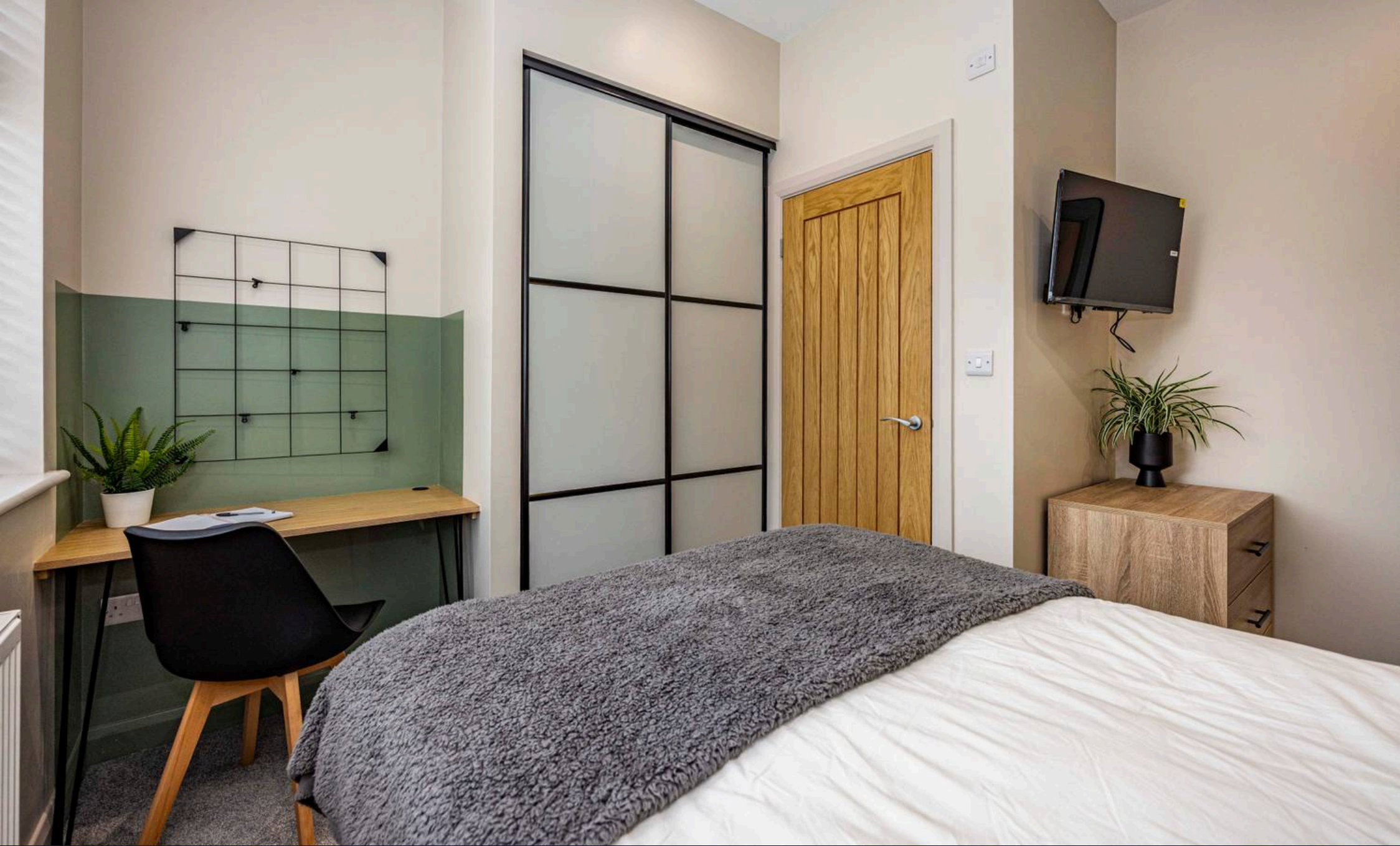
Room 1, Tamworth Road, Long Eaton £560pcm