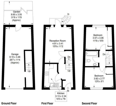
Illustration for identification purposes only. measurements are approximate, not to scale. (ID568180)

Approximate Gross Internal Area (Including Garage) 89.2 sq m / 960 sq ft