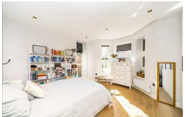
Chinbrook Road, SE12