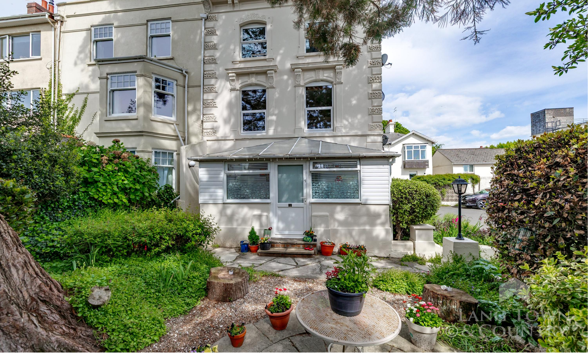
Flat 1, 4 Woodside, Lipson, Plymouth, Devon, PL4 8QE