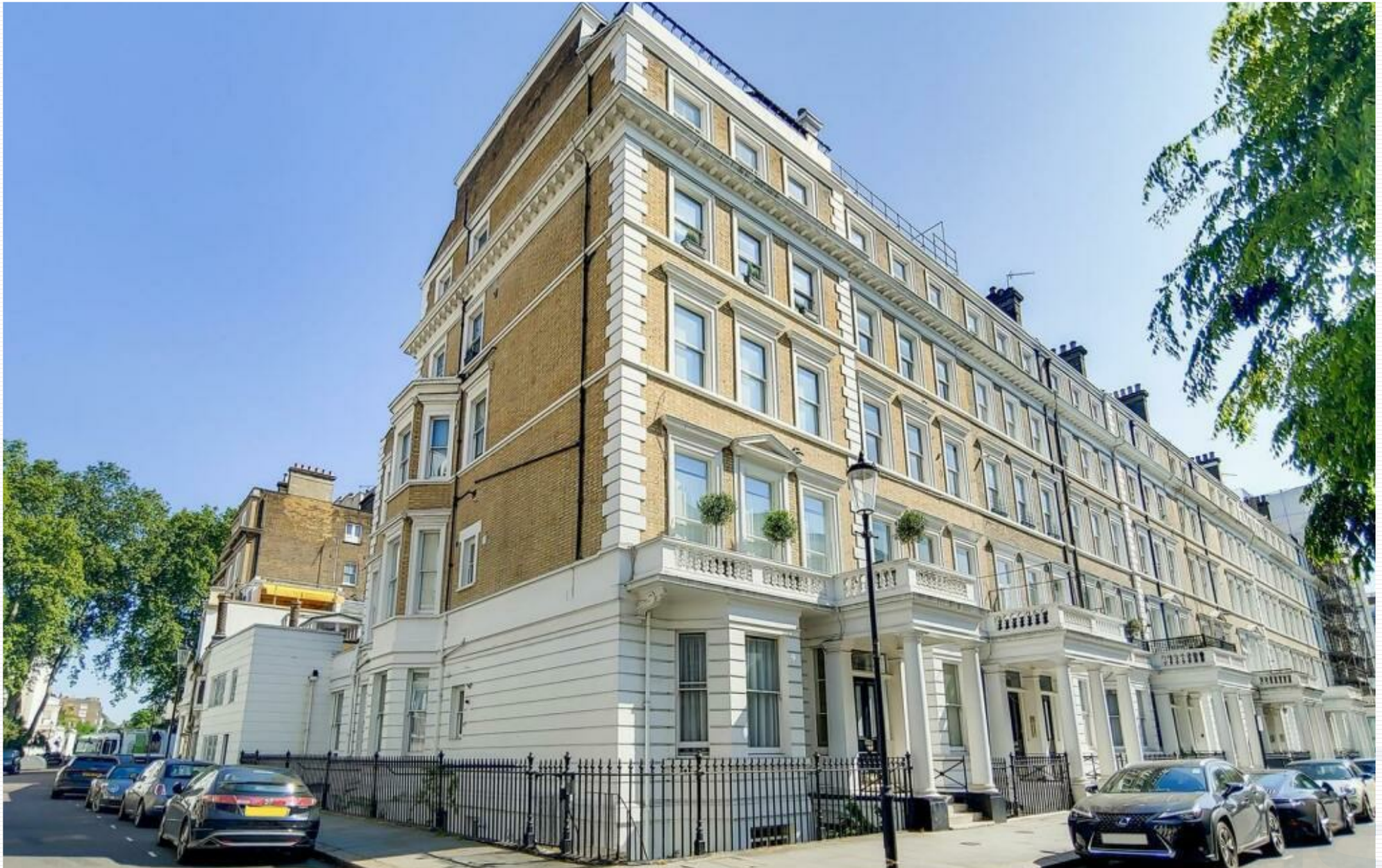
Southwell Gardens, South Kensington, SW7 4SB

Guide Price £1,050,000 Share of Freehold