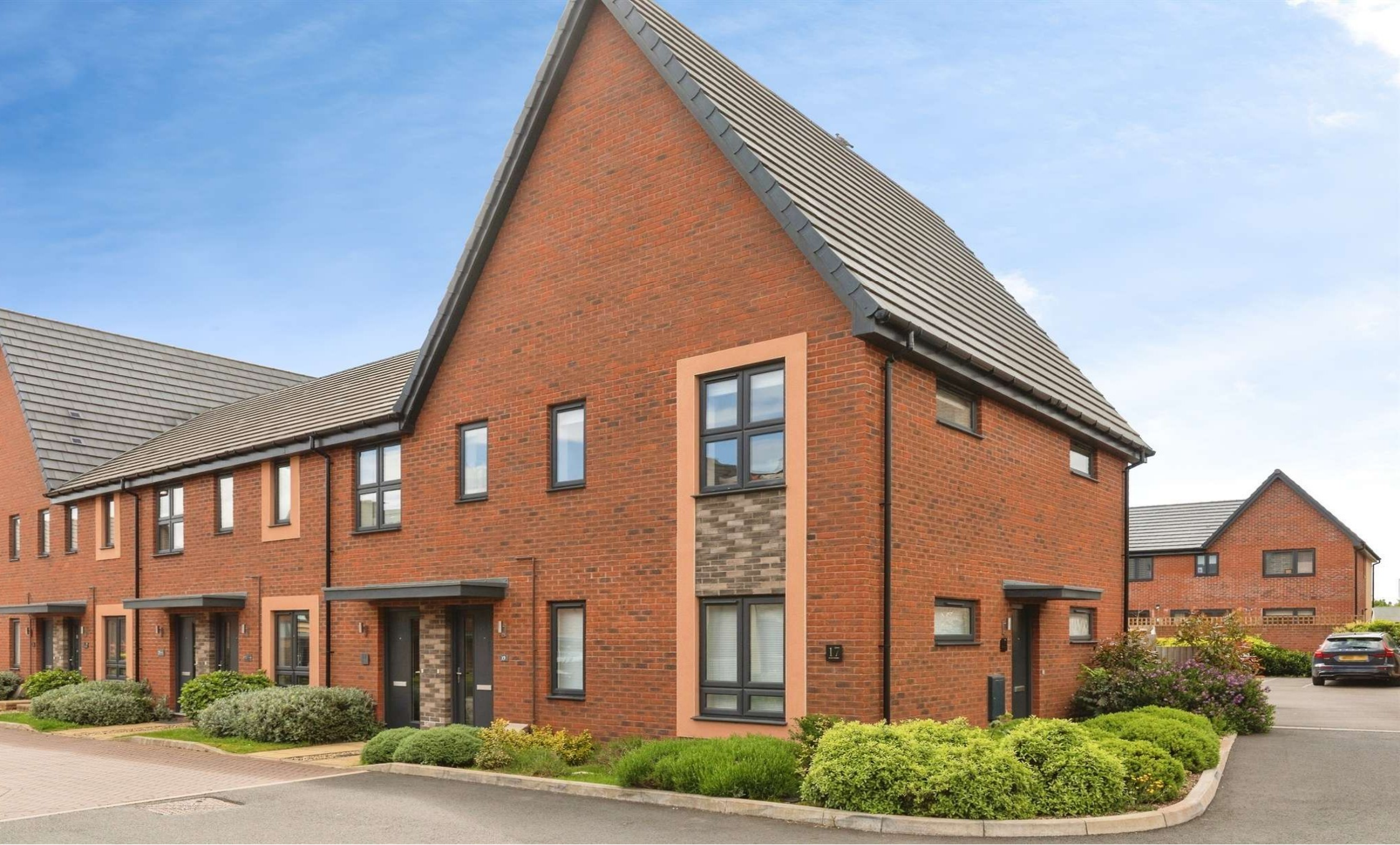
Hiscox Way, Stoke Gifford Bristol BS34 8BX