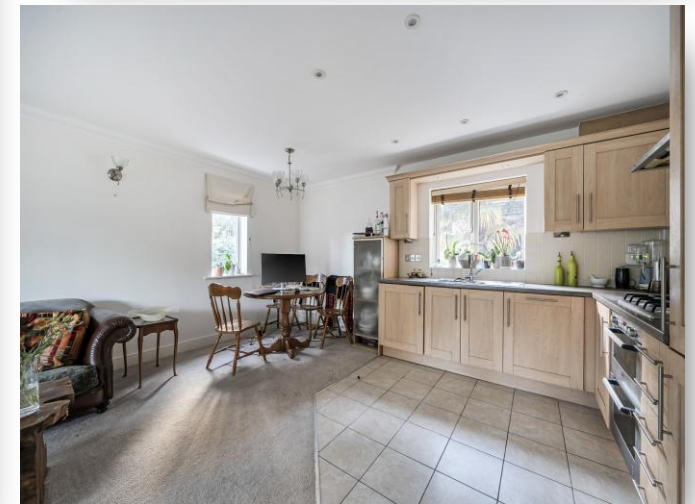
Flat 4 Cygnet House, Boulters Court, Maidenhead SL6 8TU