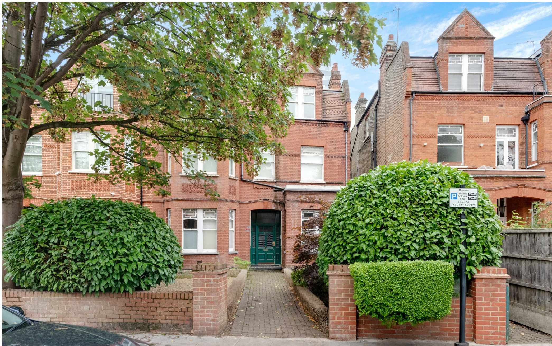
Goldhurst Terrace NW6