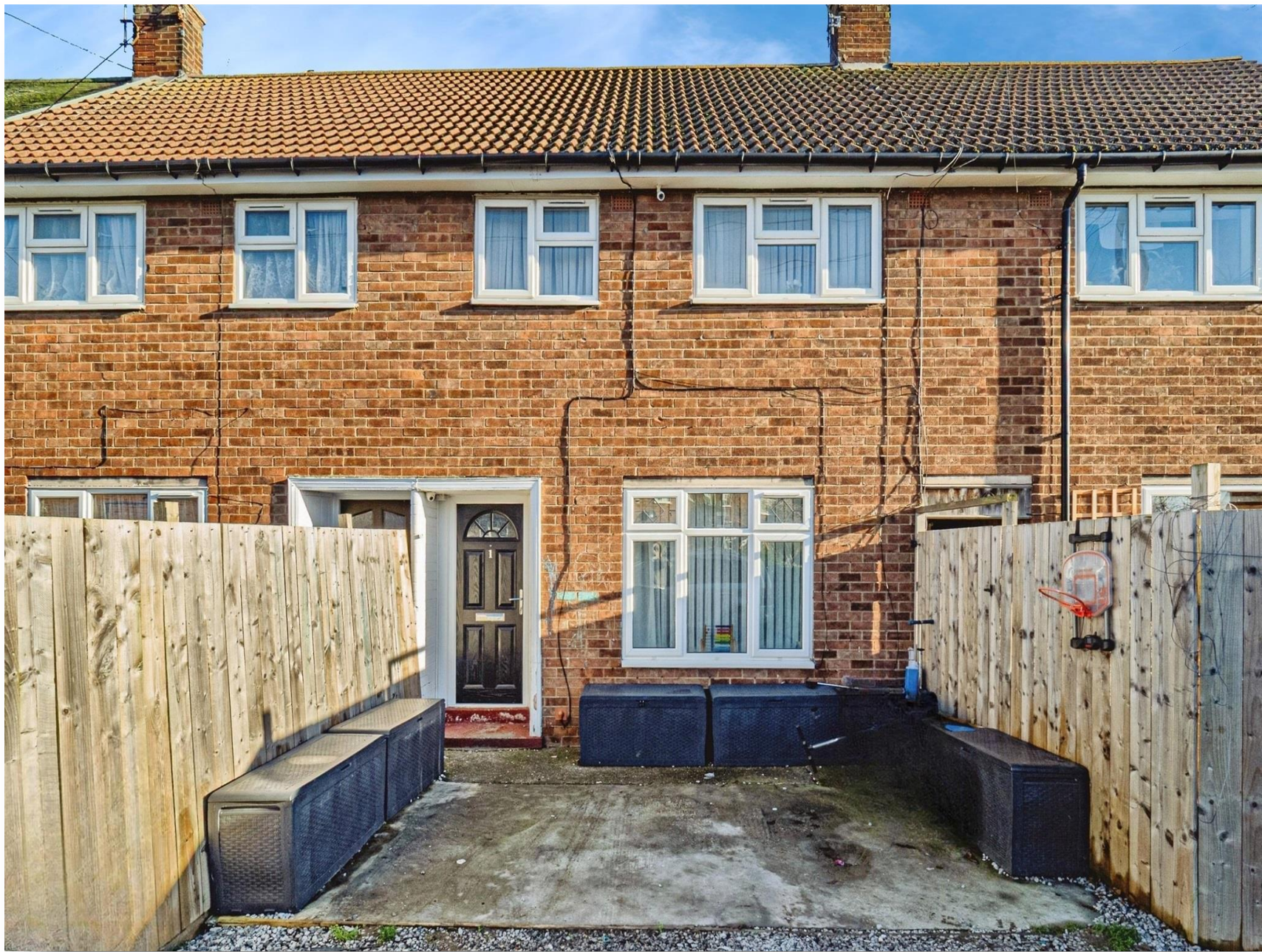
Romford Grove, Hull, HU9 5DY