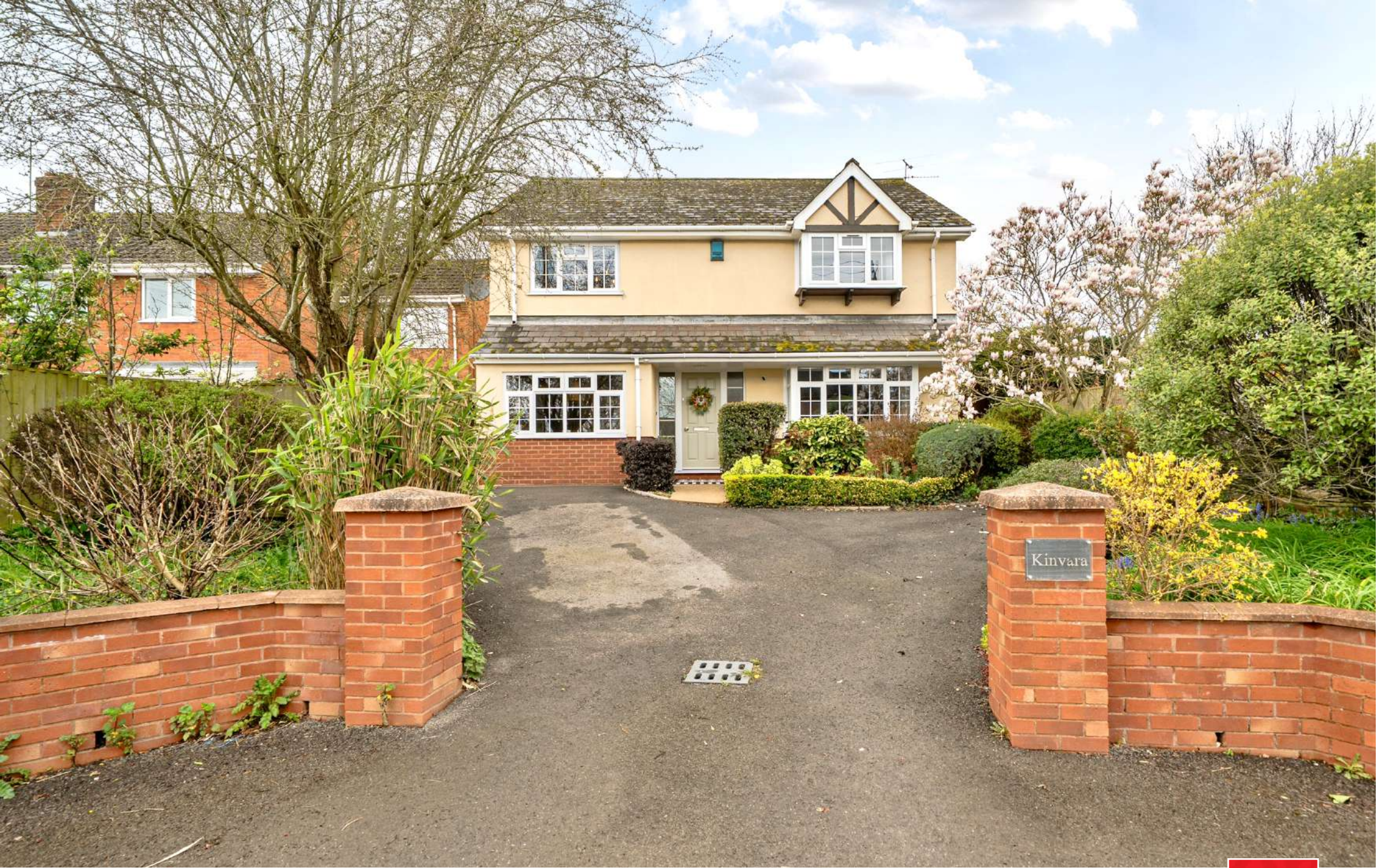
Kinvara Nynehead, Wellington TA21 0BY