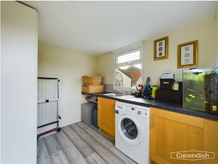
Two fitted base cupboards with laminated granite effect worktop and inset single bowl stainless steel sink unit and drainer with mixer tap and tiled splashbacks. Plumbing and space for washing machine, laminate wood strip flooring, light, power, two UPVC double glazed windows, and wooden panelled door with double glazed inserts to outside.