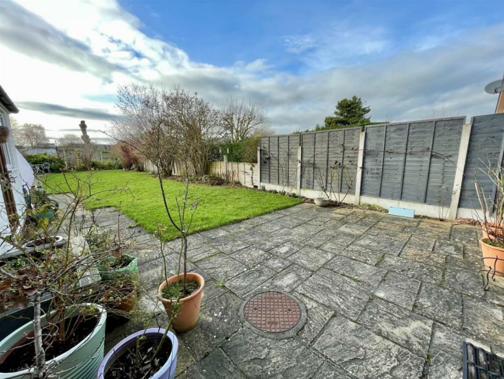
To the rear the garden is a particular feature being of a larger than average size and laid mainly to lawn with a flagged patio, pathway, decked seating area with wooden pergola, and well stocked borders, being enclosed by concrete sectional wooden panelled fencing. External power points. At the top of the garden there is a circular seating area, ornamental pond and kitchen garden with raised beds and greenhouse.