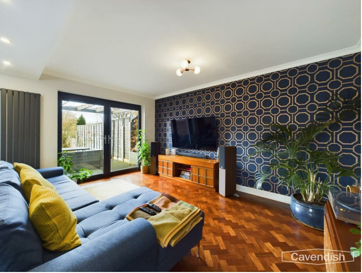
Coved ceiling with ceiling light point, five recessed spotlights, provision for wall mounted flat screen television, wood block flooring, contemporary tall radiator, and grey aluminium double opening French doors with fitted blinds to the rear garden.