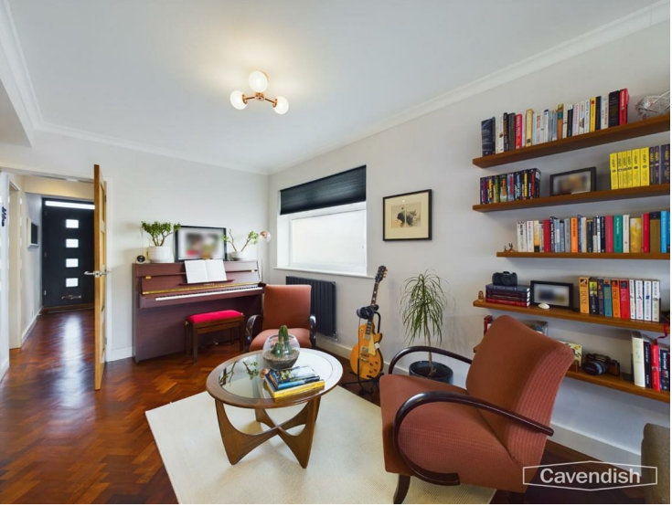
UPVC double glazed window with obscured glass to side, contemporary double radiator, coved ceiling, ceiling light point, and wood block flooring.