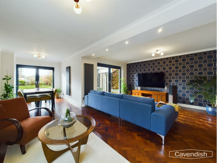
Large L-shaped open plan -room.