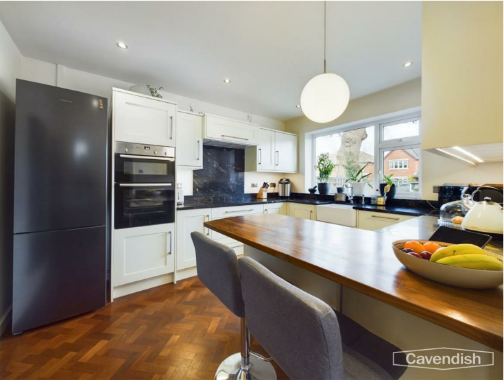
Fitted with a modern range of cream fronted base and wall level units incorporating drawers and cupboards with granite worktops and matching upstands together with a wooden breakfast bar area. Inset Belfast style sink unit with chrome mixer tap, separate extendable tap and drainer grooved into the worktop. Fitted Neff induction touch control ceramic hob with granite splashback and extractor above, and built-in Neff electric double oven and grill. Space for tall fridge/freezer, integrated Neff dishwasher, wood block flooring, contemporary tall radiator, recessed LED ceiling spotlights, ceiling light point, and UPVC double glazed window overlooking the front.