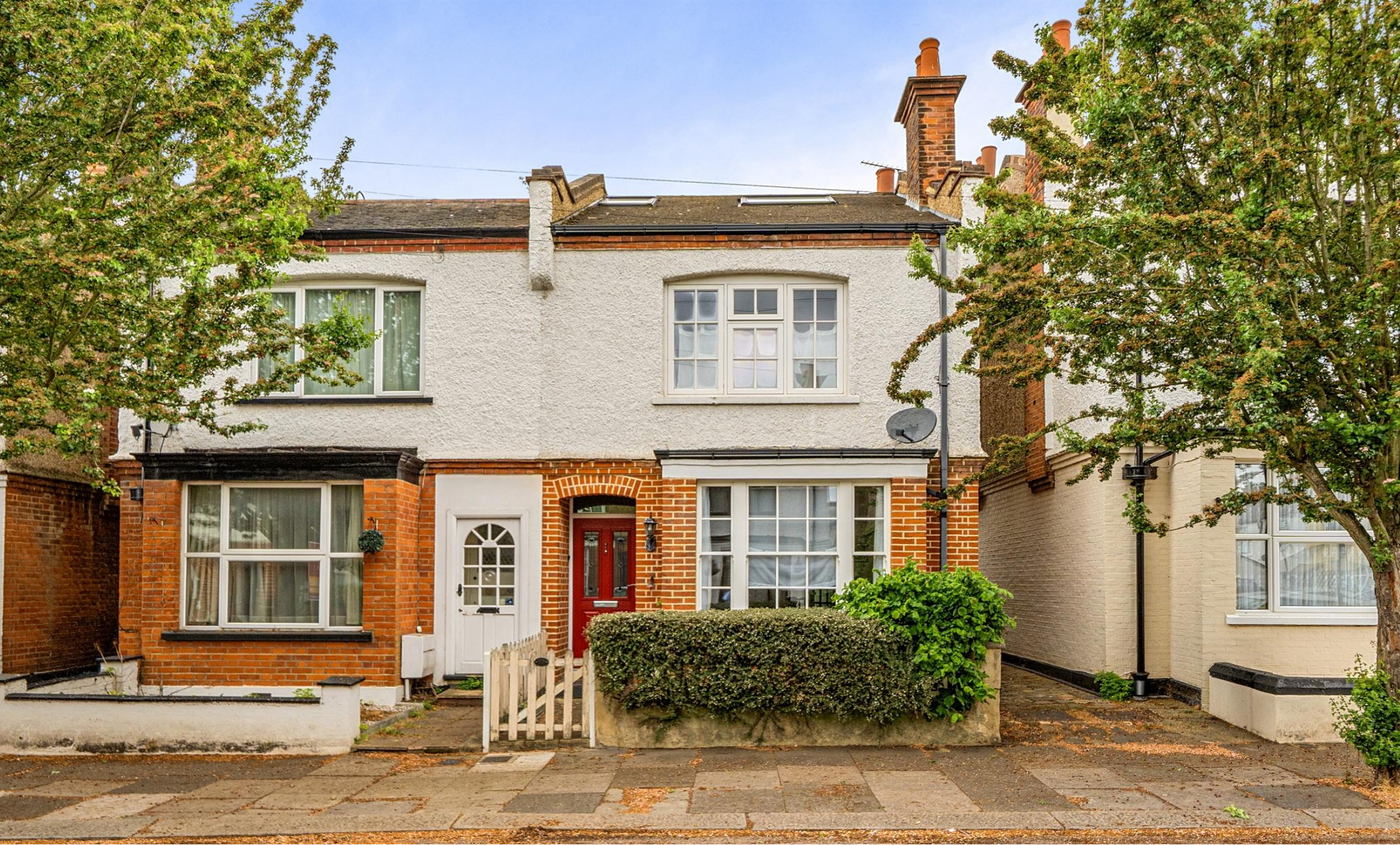
Kimberley Gardens, Enfield, EN1 3SW