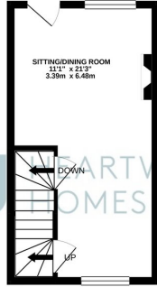
GROUND FLOOR 233 sq ft. (21.8 sq m) approx.