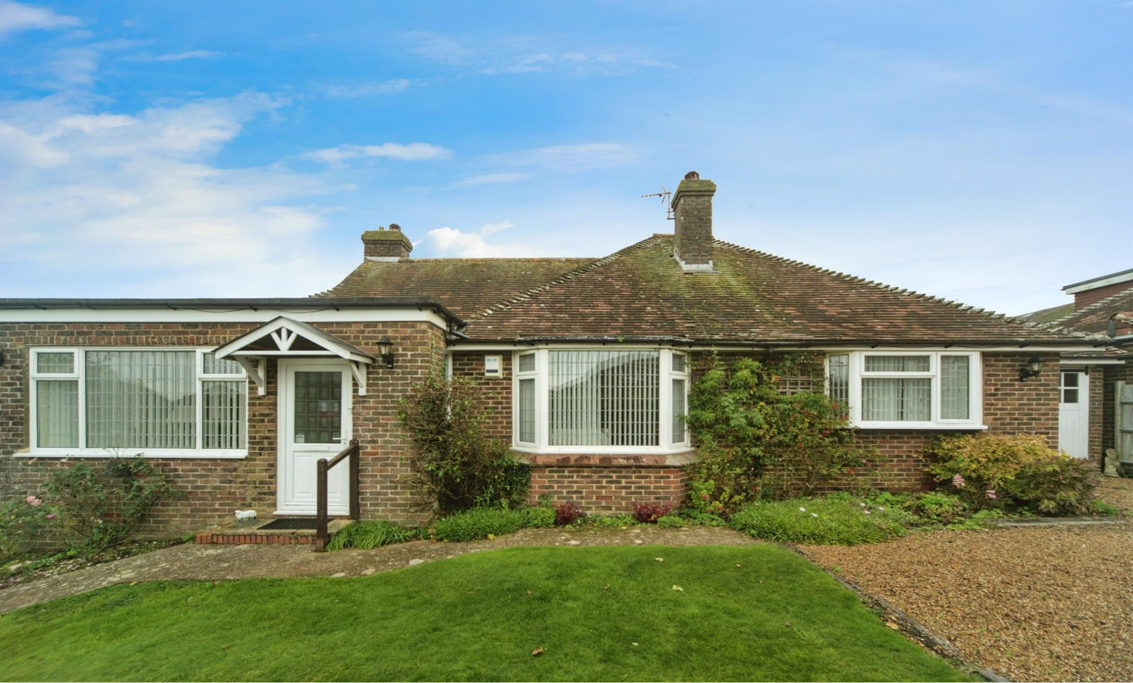
Holbrook Cottage - Maple Avenue, Bexhill-On-Sea TN39 4ST