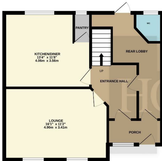
GROUND FLOOR 540 sq.ft. (50.2 sq.m.) approx.