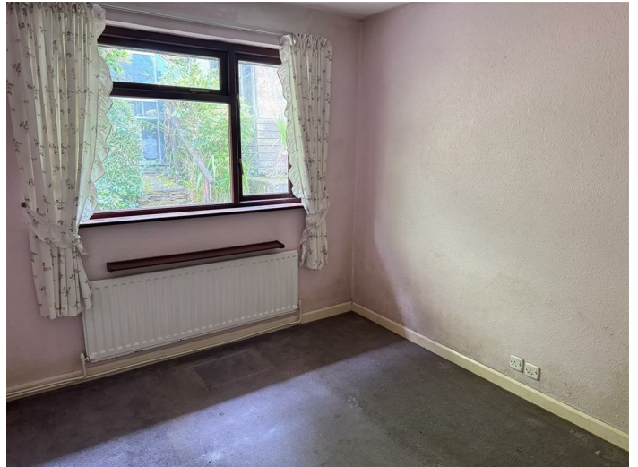
Window to rear. Central heating radiator