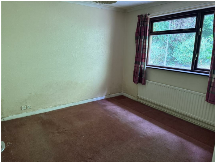
Bedroom: 10'9" x 8'10" (3.3 x 2.7)