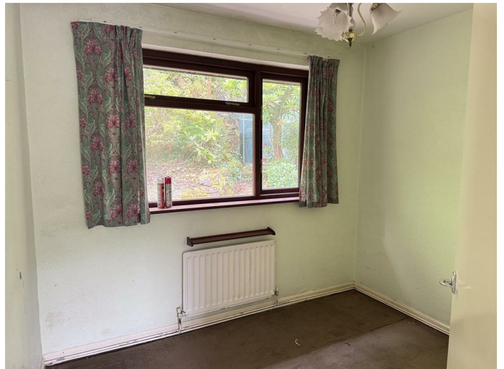
Window to rear. Central heating radiator.