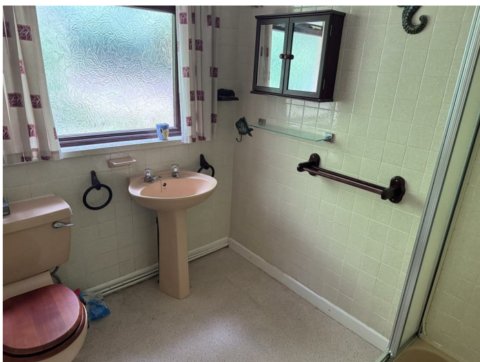
Central heating radiator. Low-level WC, wash basin and shower cubicle with electric shower unit