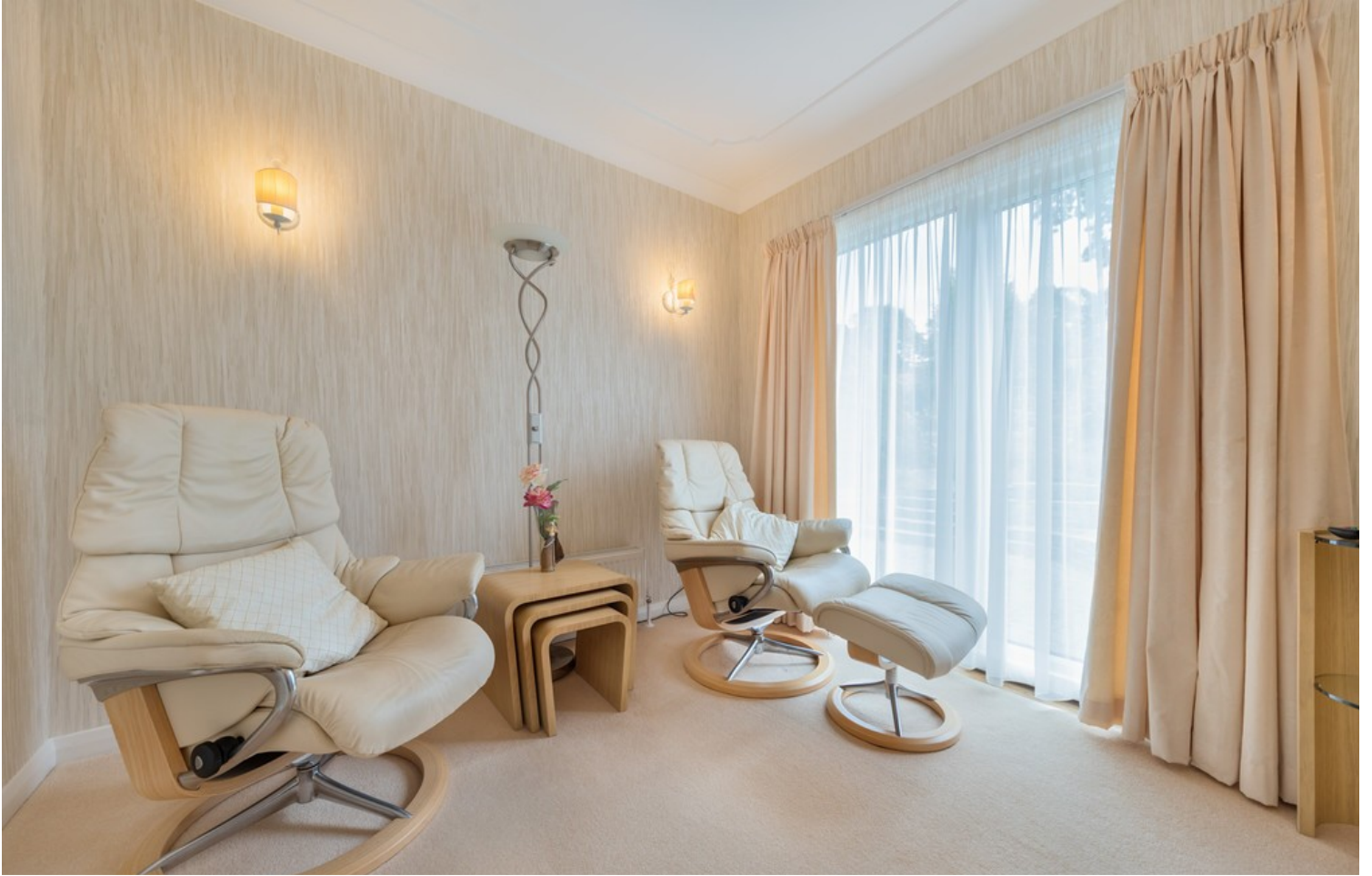
Bedroom Three/Sitting Room