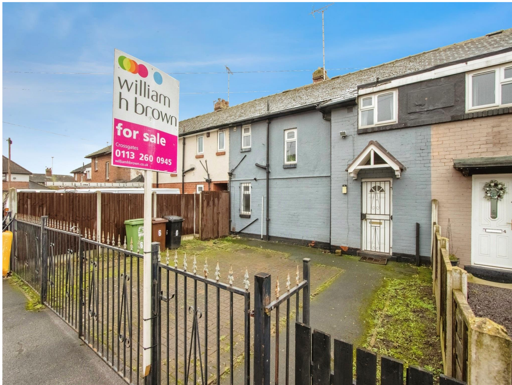
Neville Terrace, Leeds LS9 0LA