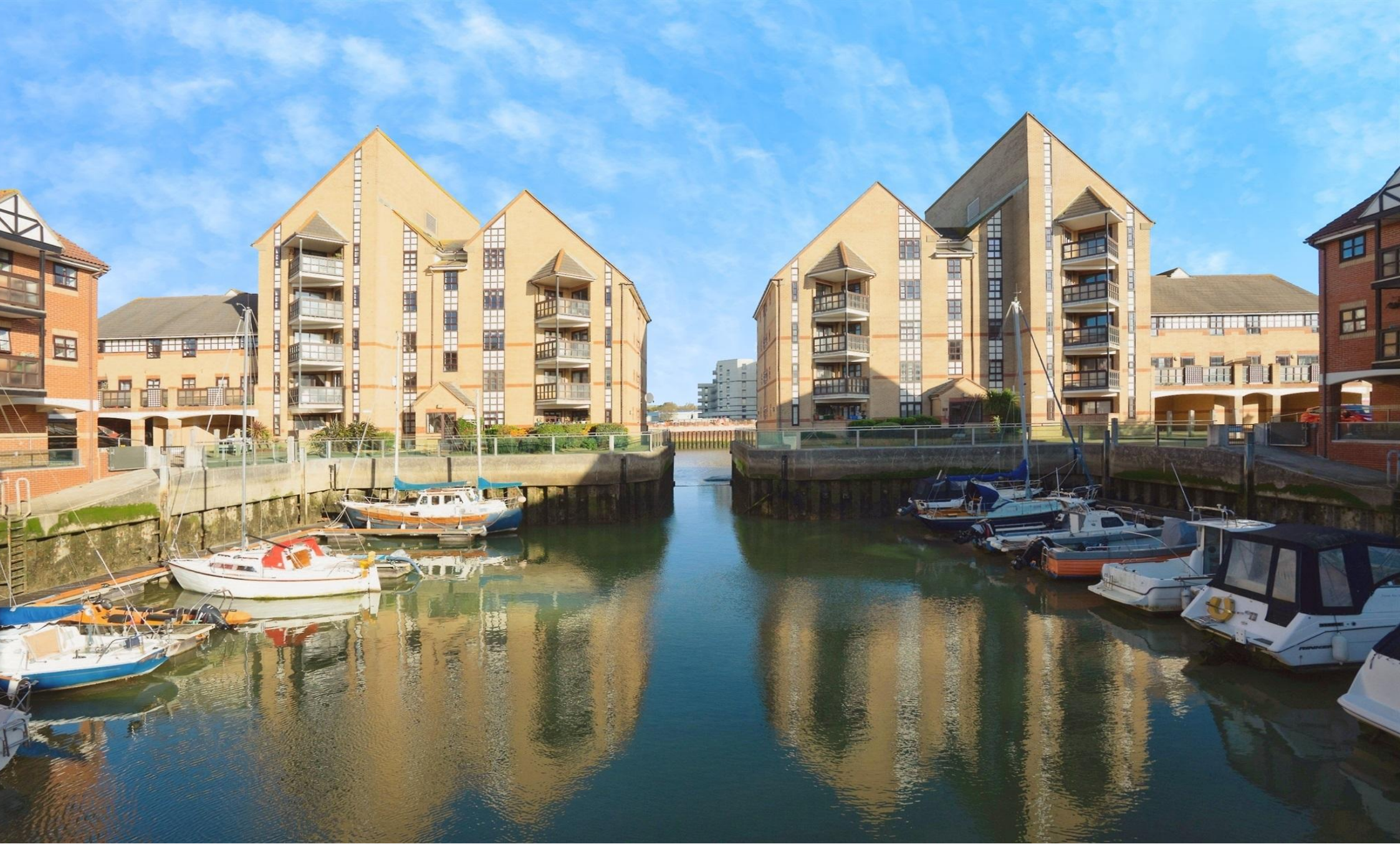
St. Nicholas Place Emerald Quay, Shoreham-By-Sea BN43 5JR