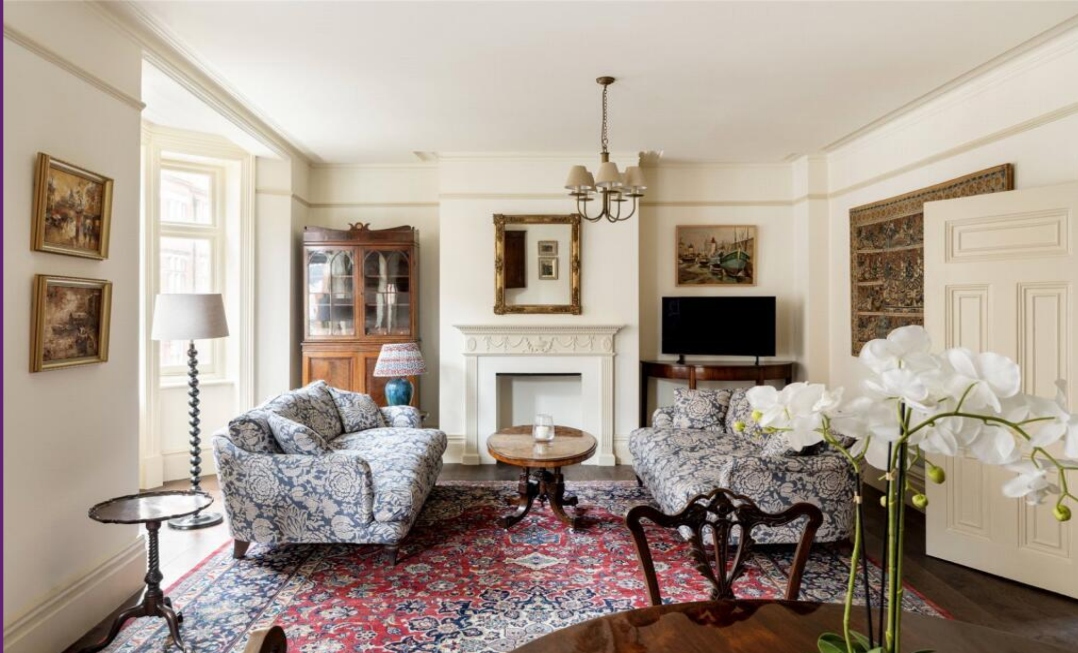
Culford Mansions Culford Gardens, SW3