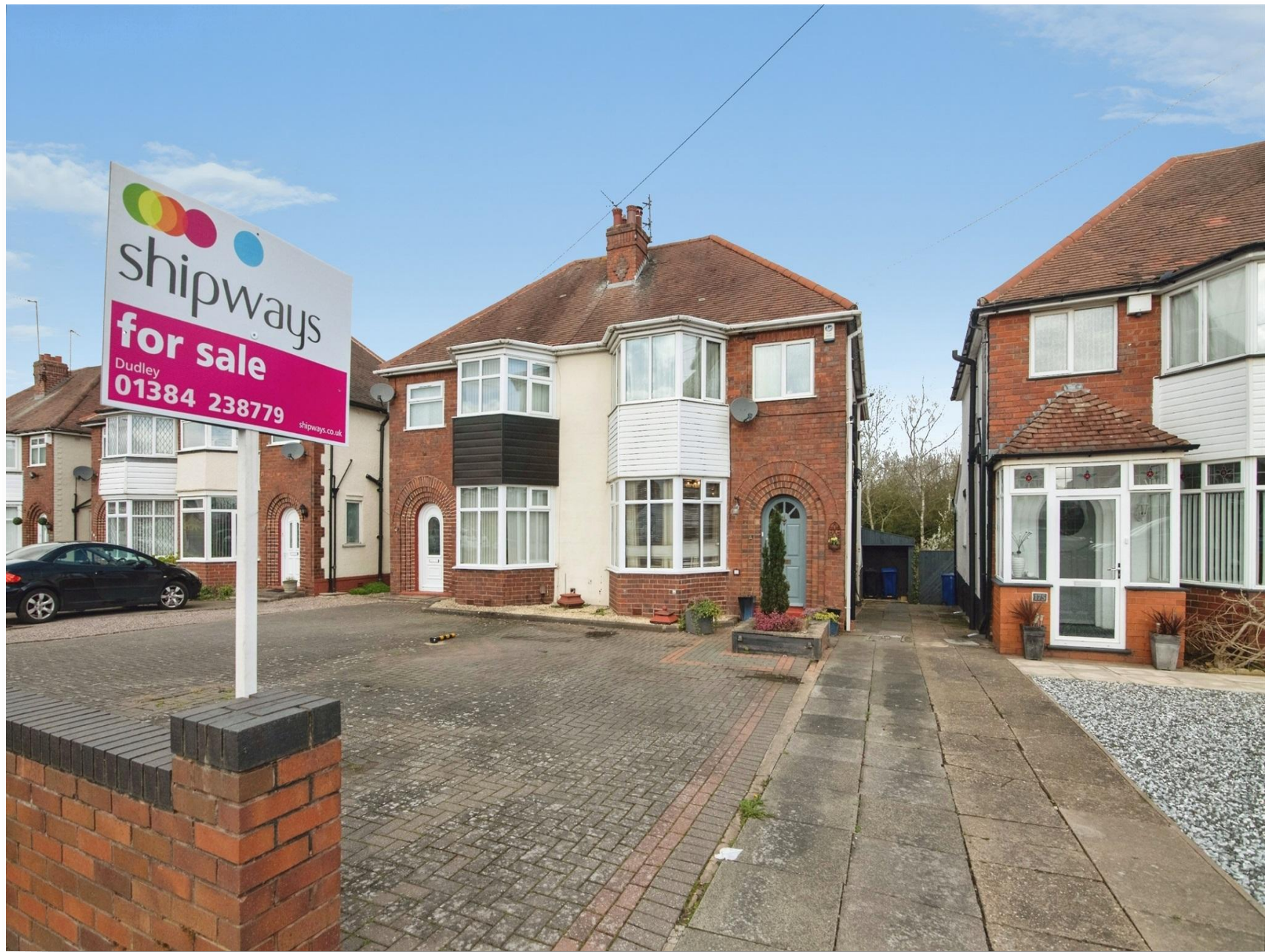
High Street, Pensnett Brierley Hill DY5 4DZ