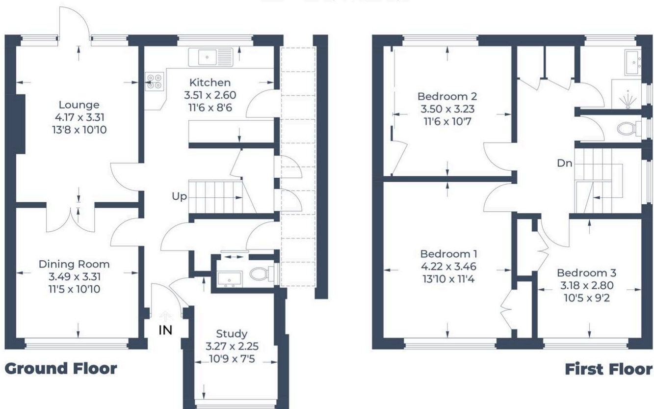
Illustration for identification purposes only, measurements are approximate, not to scale. © CJ Property Marketing Produced for Trend & Thomas

Approximate Gross Internal Area Ground Floor = 64.8 sq m / 697 sq ft First Floor = 54.5 sq m / 586 sq ft Total = 119.3 sq m / 1,283 sq ft