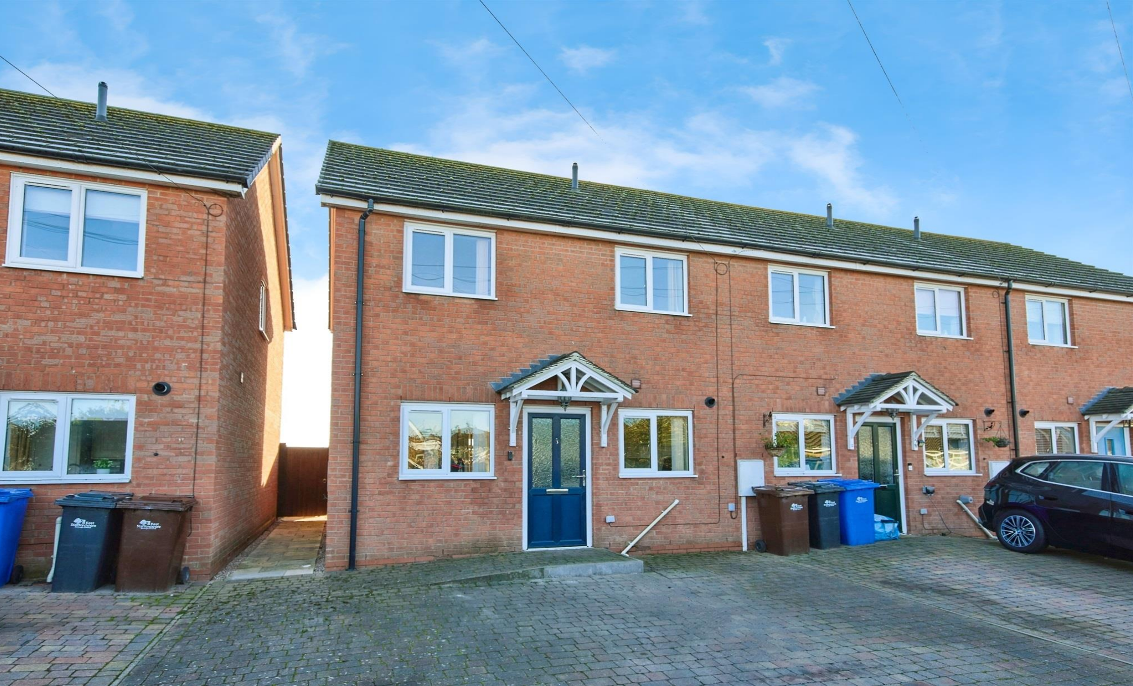
Farman Row, Burton-On-Trent