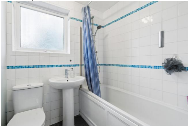
BATHROOM white suite comprising enclosed panelled bath with shower over, wash hand basin, low level wc, heated towel rail, double glazed frosted window, tiled floor.