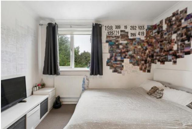
BEDROOM THREE with front aspect double glazed window, walk in wardrobe, radiator.