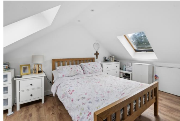
BEDROOM ONE a dual aspect room with Velux windows, eaves storage, laminated wood flooring, radiator.