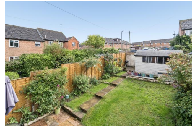
THE REAR GARDEN: with paved patio area leading onto the remainder of the garden which is laid to lawn and enclosed by panel fencing. Garden shed. Gated rear access.