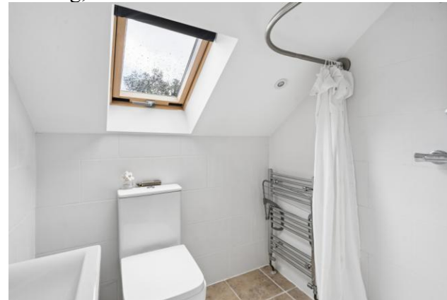
EN SUITE SHOWER ROOM with shower, vanity wash basin, low level wc, tiled floor and walls, Velux window.