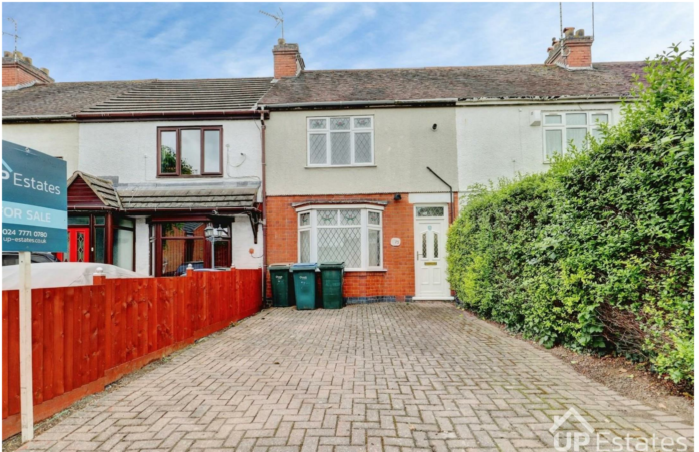
Aldermoor Lane, Coventry