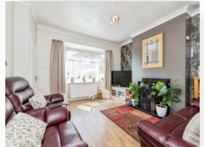
Elmwood Road, Hartlepool TS26 0JS