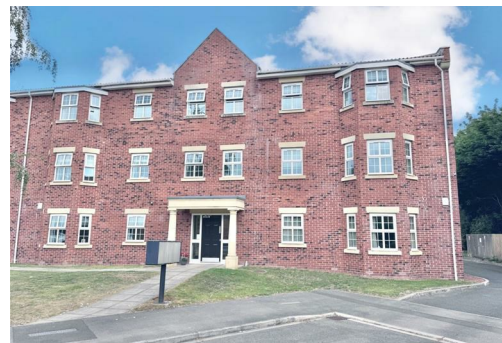
26 Rymers Court, Darlington, DL1 2GB.

We are acting in the sale of the above property and have received an offer of £65,000 on the above property.