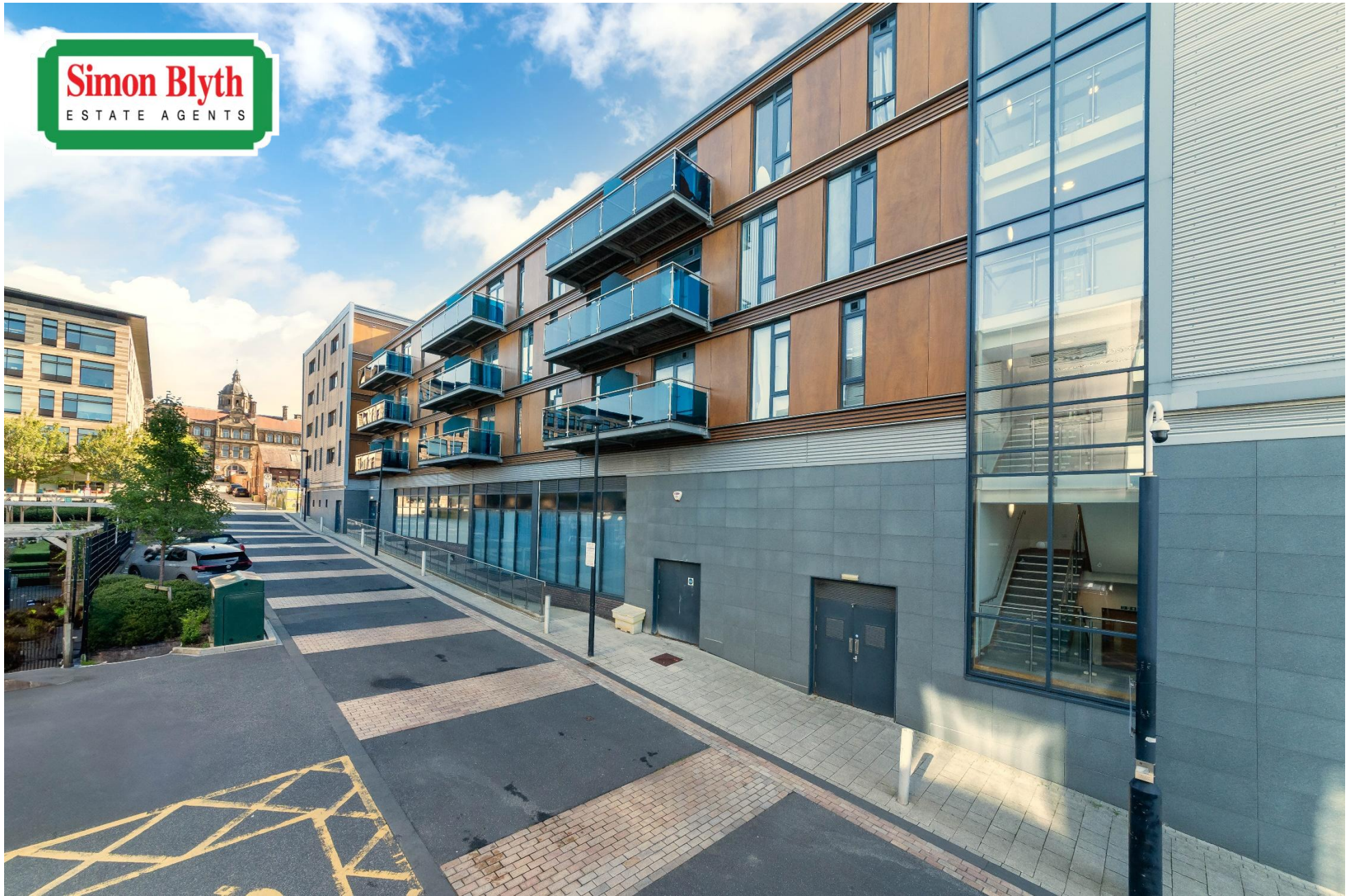
58 MULBERRY HOUSE, BURGAGE SQUARE, WAKEFIELD, WF1 2SE