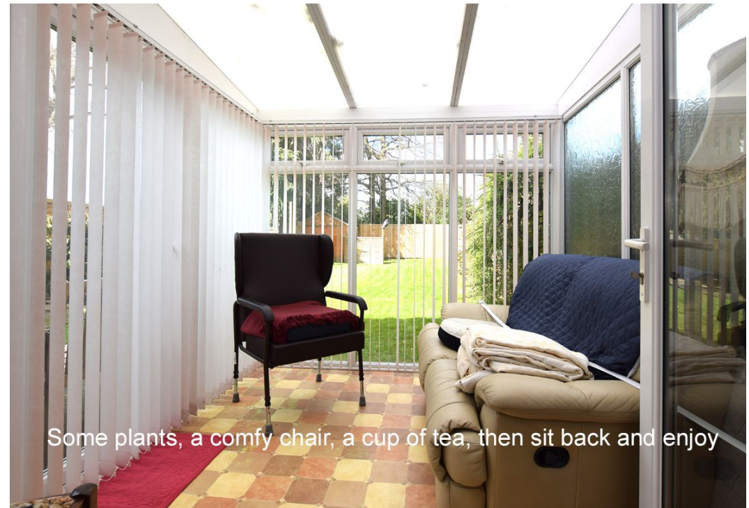
Some plants, a comfy chair, a cup of tea, then sit back and enjoy