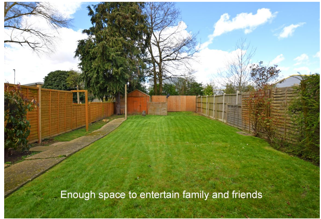
Enough space to entertain family and friends